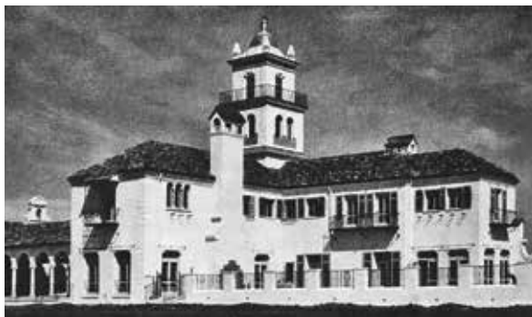
La Quinta Mansion, completed 1932

Colorado Springs Bible College was initiated by the Pilgrim Holiness Church to train students for full-time Christian service. It expanded to include students desiring to attend college in a Christ-centered environment and later relocated to Bartlesville, Oklahoma.